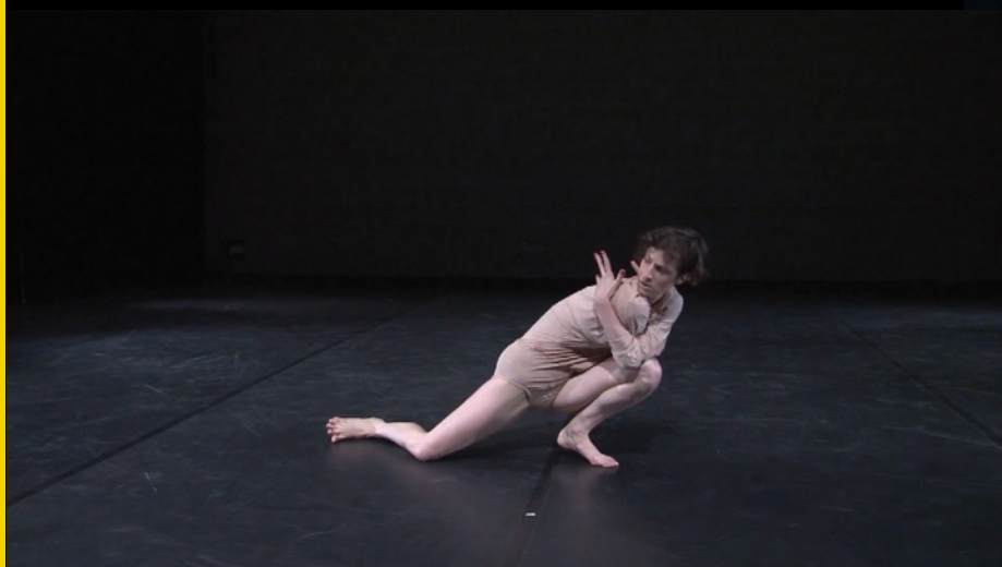
Video: Ravid Abarbanel Camera: Christophe Blavier